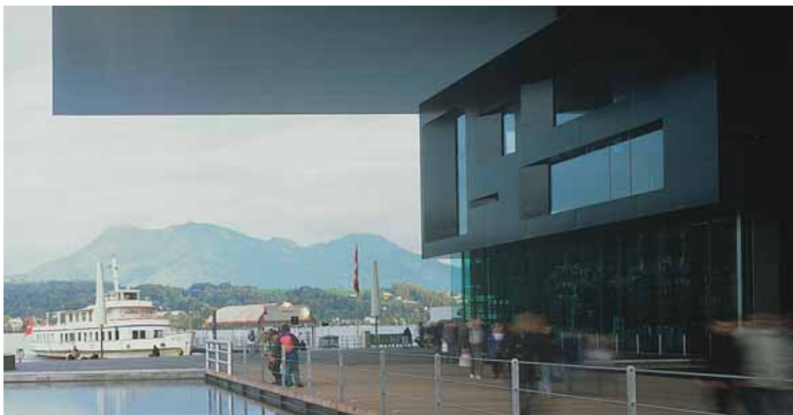
The Culture and Convention Centre Lucerne (KKL) – designed by renowned architect Jean Nouvel – is located in the city centre next to the main railway station, on the shores of Lake Lucerne.

A successful referendum in Switzerland in 2005 set in place a ban on the use of GMOs in agriculture. For this reason, the country represents an ideal platform for the 2009 meeting. The Culture and Convention Centre Lucerne (KKL) by Lake Lucerne is a suitable venue. About 400 participants from 30 European countries are expected to attend the gathering.